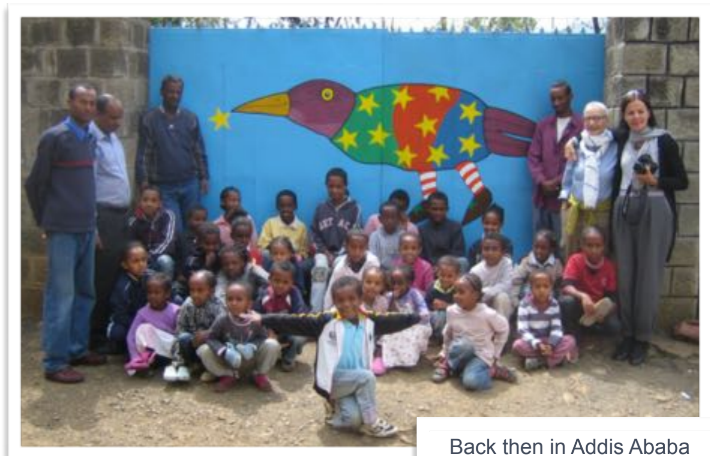
Back then in Addis Ababa

She encouraged us to come to Addis Abeba and so we set off on our journey. The trip was a further motivation boost for our activities.